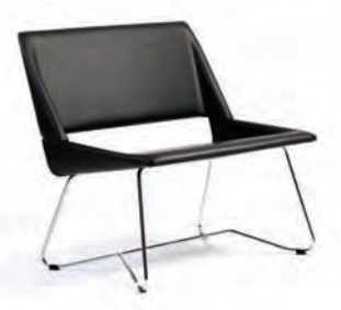
KIILA LOUNGE RA

Kiila is the winner of the Inno Design Award competition. Kiila is a product family of chairs with different sized seats and various leg options and tables. Kiila has a unique style and identity, classic features with a modern twist and it fits naturally in interiors as meeting rooms, dining rooms, restourants, bars, entrance areas, waiting rooms, lobbies and hotels.