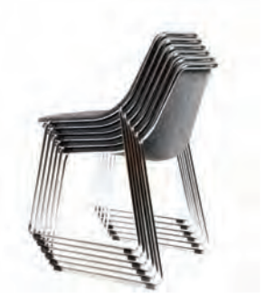
KOLA STACK A